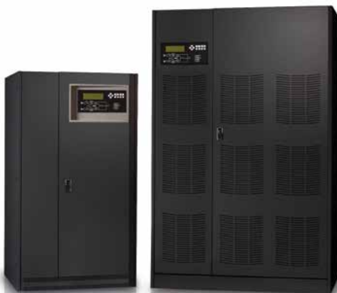
Eaton 93 STS family