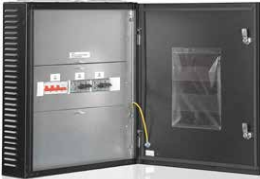
External MBS 50kW

External Maintenance Bypass Switches (MBS) add safety and reliability by enabling seamless transfers to bypass and isolation of the UPS system for maintenance. Eaton external MBSs are designed by UPS standard IEC 62040.