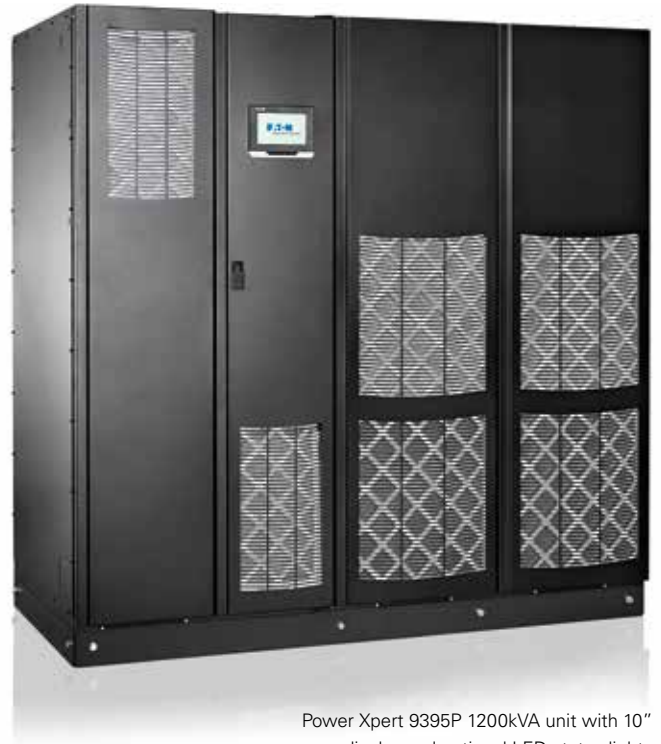
Power Xpert 9395P 1200kVA unit with 10" display and optional LED status lights