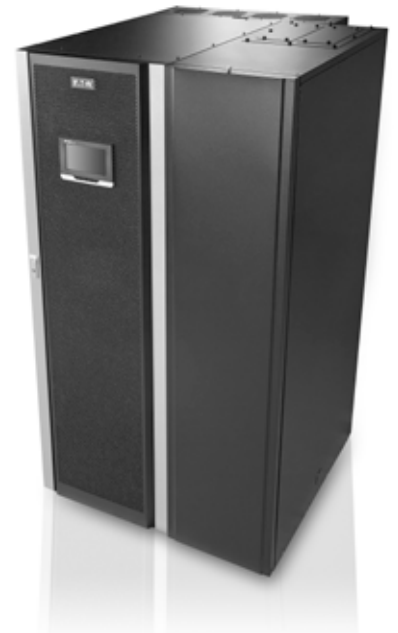
Eaton 93PM 200kW with SIAC MBS and Top air exhaust kit

Sidecar Integrated Accessory Cabinet (SIAC) MBS option for the 93PM 200kW frame, expands the internal MBS offering up to 200kW. Sidecar MBS option adds safety and reliability by enabling seamless and easy transfers to bypass for the UPS system maintenance. There are two different alternatives available, one with three switches: MBP+MIS and RIB, and one with four switches MBP+MIS, RIB and BIB. This kit can only be assembled on the Eaton factory.