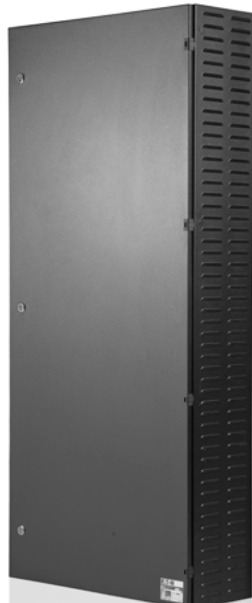
External MBS 100kW and 150kW door closed