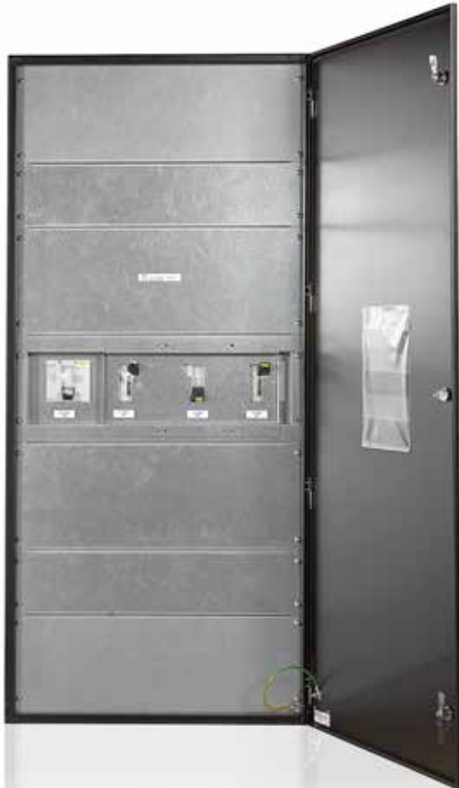
External MBS 100kW and 150kW